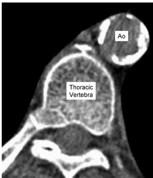
Figure 3. Example of an axial CT image showing dense calcification in the wall of the aorta next to the body of a thoracic vertebra.

increase in vascular stiffness as measured by PWV. 10,20 In turn, increased PWV is associated with an increased mortality in hemodialysis patients. 11 Hence, observational studies, such as that by Taal et al, 12 suggesting an increase in mortality proportional to bone demineralization in dialysis patients, may in fact be indicative of worsening vascular disease in the presence of worsening bone disease. Patients with CKD-5 frequently suffer from abnormalities of bone metabolism and remodeling predominantly in 2 forms: hyperdynamic and adynamic bone disease. In the former, excessive bone resorption causes rapid accrual and removal of calcium and phosphorus from the bone. In the adynamic state, the bone tissue rests in an indolent and inactive phase with very little ongoing remodeling and accrual of calcium. In both cases, poor bone mineralization and excessive calcium and phosphorus in the circulation likely favor deposition of hydroxyapatite crystals in soft tissues. Indeed, Braun et al 21 described an inverse correlation between coronary artery calcium and vertebral